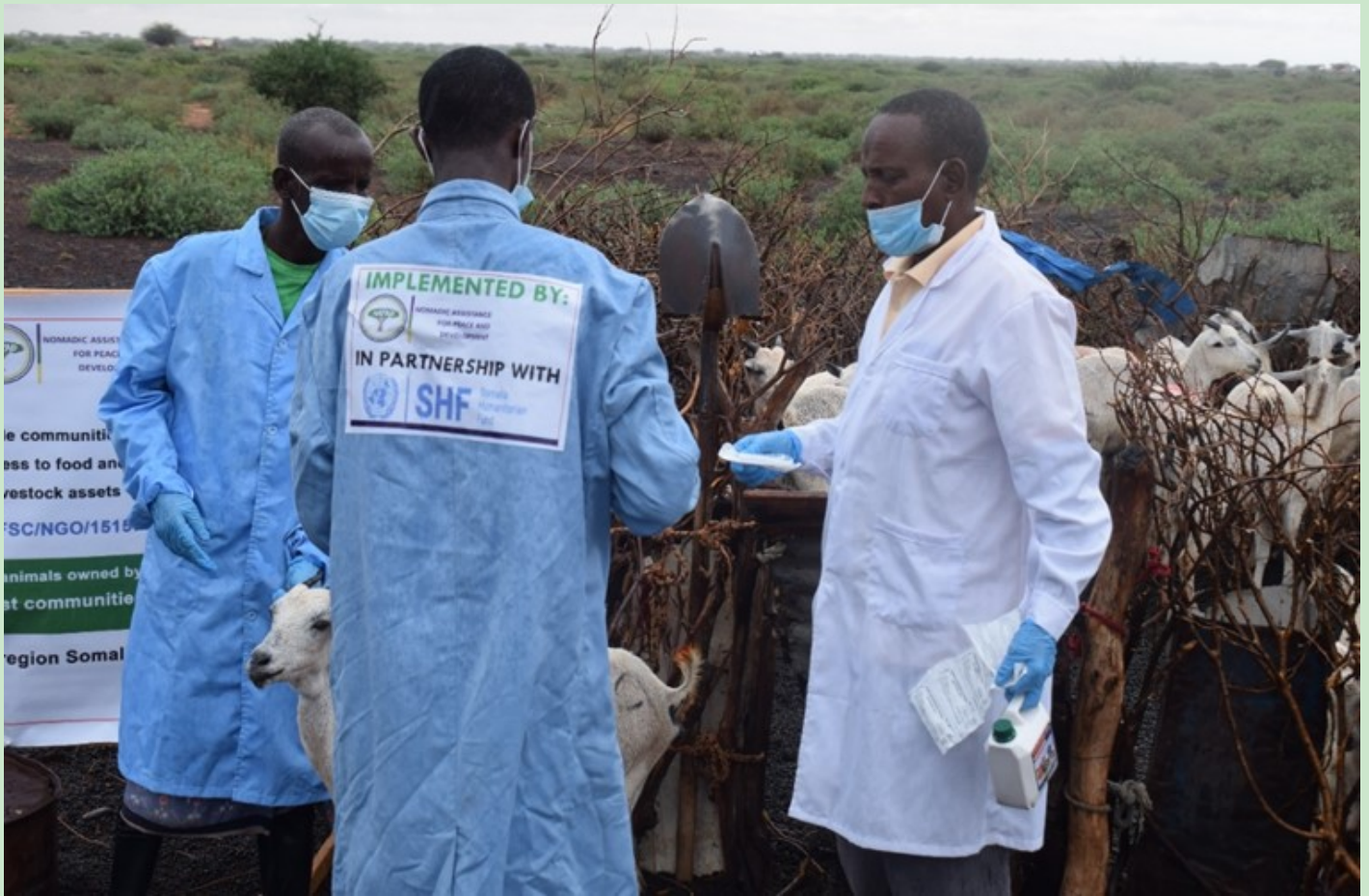
Community Animal Health Workers during the livestock treatment exercise

NAPAD partnered with Somalia Humanitarian Fund (SHF) to treat approximately 27,000 livestock from the villages of Shilamadow, Darasalam, Dafle, Wanagsan, Gesweyne and Barwaqo in Abudwak district, Galgaduud Region. The treatment exercise conducted by Community Animal Health Workers, involved, administering antibiotics to treat common diseases such as pneumonia and sheep and goat pox, deworming, hoof trimming and provision of multivitamins to the weak animals.