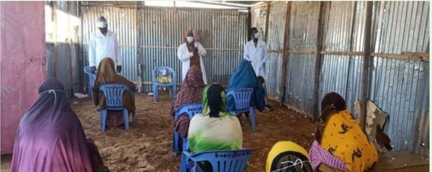
COVID 19 Hygiene promotion in a Health Center

Somalia is grappling with the implications of millions of people being internally displaced. The outbreak of COVID-19 compounds the already fragile situation characterized by overpopulated IDP camps and little access to adequate water for good hygiene practices leaving the population highly vulnerable to disease outbreaks. NAPAD in partnership with Diakonie Katastrophenhilfe supported 2032 households in 18 IDP cluster segments within Kaxda and Garasbaley IDPs in Mogadishu, who are at heightened risk of COVID-19 transmission to improve their hygiene practices through improved access to water and aggressive hygiene promotion outreaches... Read More