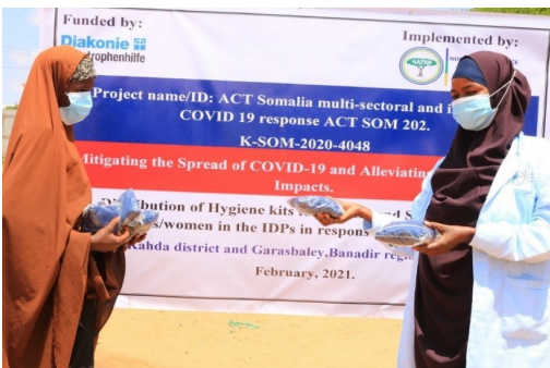
Reusable sanitary pads distribution

Somalia is grappling with the implications of millions of people being internally displaced. The outbreak of COVID-19 compounds the already fragile situation characterized by overpopulated IDP camps and little access to adequate water for good hygiene practices leaving the population highly vulnerable to disease outbreaks. NAPAD in partnership with Diakonie Katastrophenhilfe supported 2032 households in 18 IDP cluster segments within Kaxda and Garasbaley IDPs in Mogadishu, who are at heightened risk of COVID-19 transmission to improve their hygiene practices through improved access to water and aggressive hygiene promotion outreaches... Read More